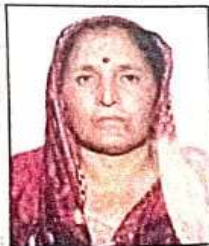
ससदय इन्द्रा देवी