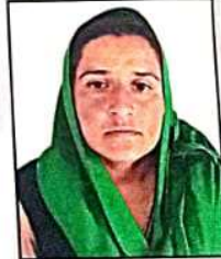
जीह देवी सदस्य