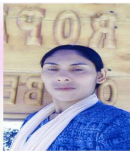
Meena Kumari .